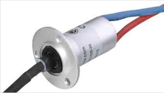
标准型(Standard Type) SRC025-30